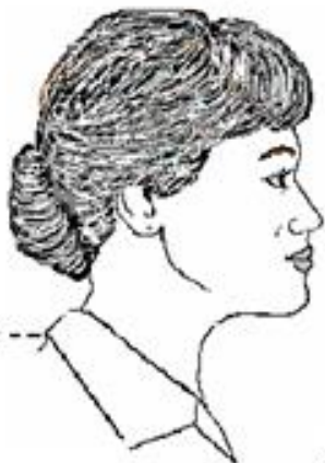
Long Hair Length