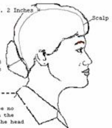
Bulk of Hair

Buns may be no wider than the width of the head