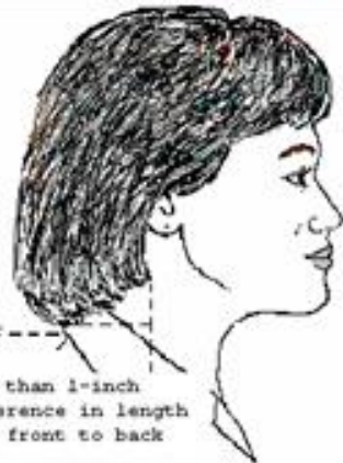
Medium Hair Length

Less than 1-inch difference in length from front to back