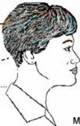
Short Hair Length